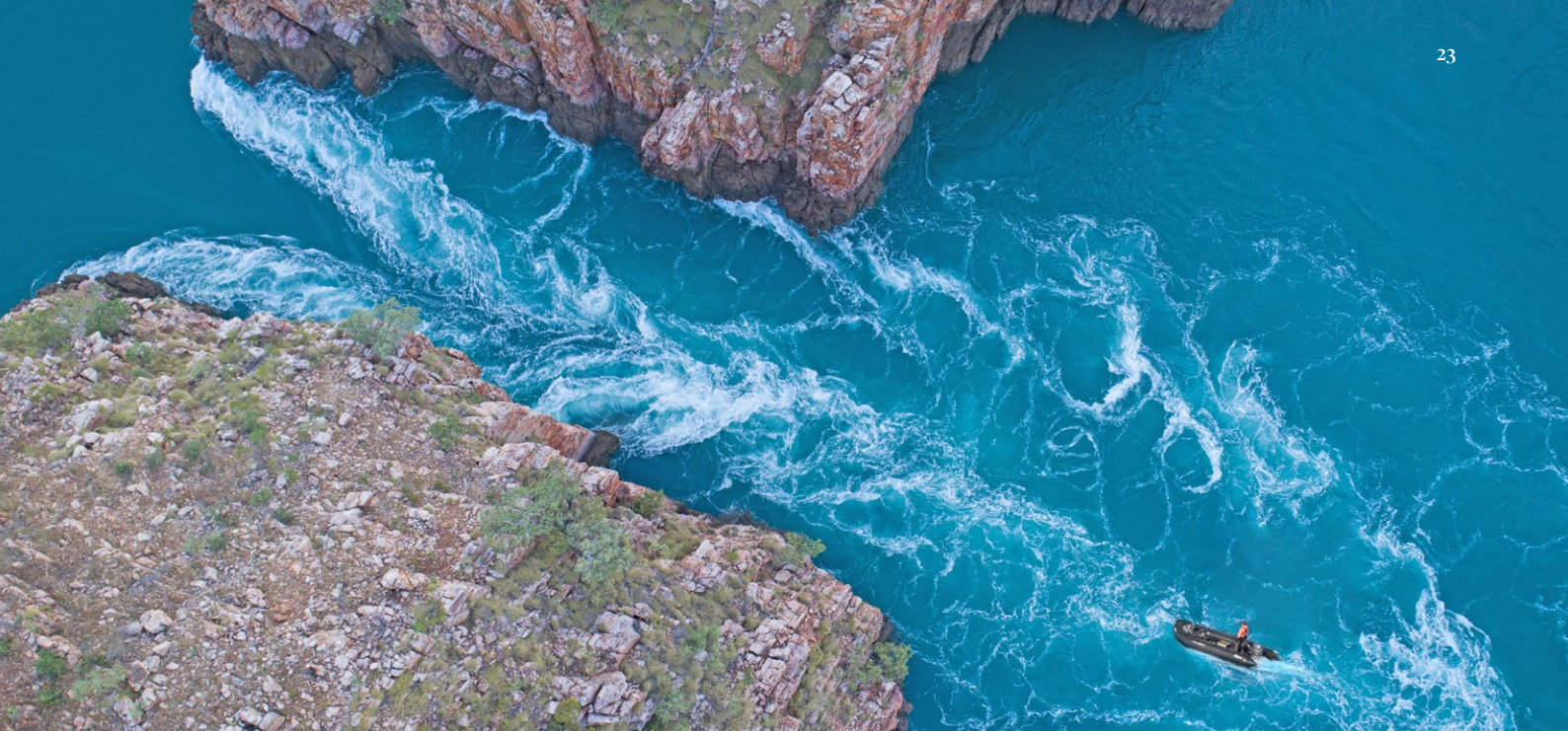
Horizontal Falls, Talbot Bay