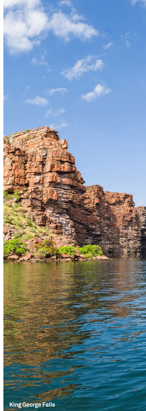
King George Falls

Fringed by sugar-white sand with a backdrop of sapphire sky and sea, these four islands are a haven for wildlife such as green cerulean turtles, which are considered endangered. Various bird species are also found here including lesser frigatebirds, crested terns, sandpipers, ruddy turnstones, and one of the world's largest colonies of brown boobies.