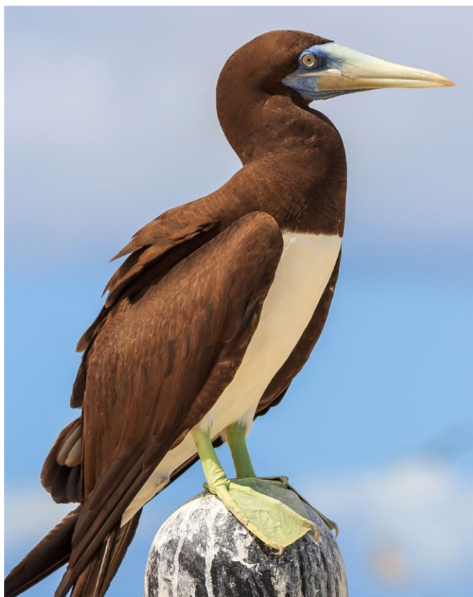
Brown Boobies, Lacepede Islands Nature Reserve