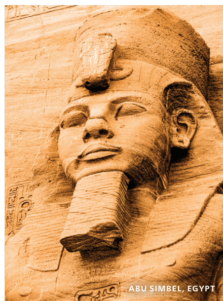
ABU SIMBEL, EGYPT