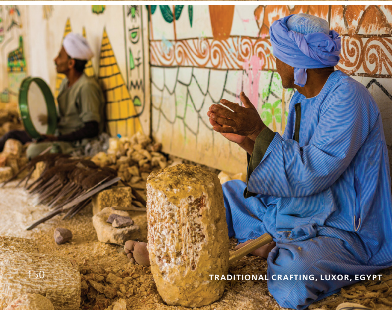
TRADITIONAL CRAFTING, LUXOR, EGYPT