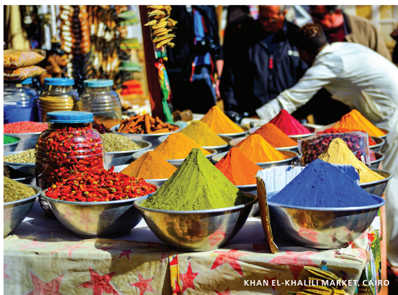
KHAN EL-KHALILI MARKET, CAIRO