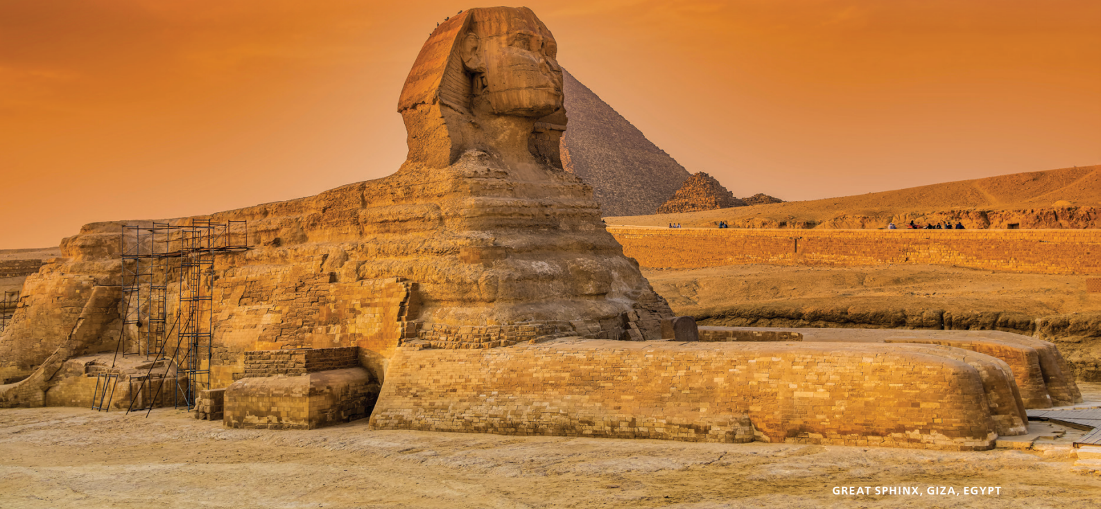
GREAT SPHINX, GIZA, EGYPT

SEE THE GREAT PYRAMIDS OF GIZA, the last of the Seven Wonders of the Ancient World still standing. Explore Luxor and Karnak, then opt to ride a hot air balloon over the Valleys of the Kings and Queens. Be moved by the lovely Temple of Isis at Philae, accessible only by boat. Behold Abu Simbel, perched above Lake Nasser, then cruise this serene waterway. The Nile is Egypt's lifeblood, and our 12-day sojourn offers a comprehensive Nile cruisetour.