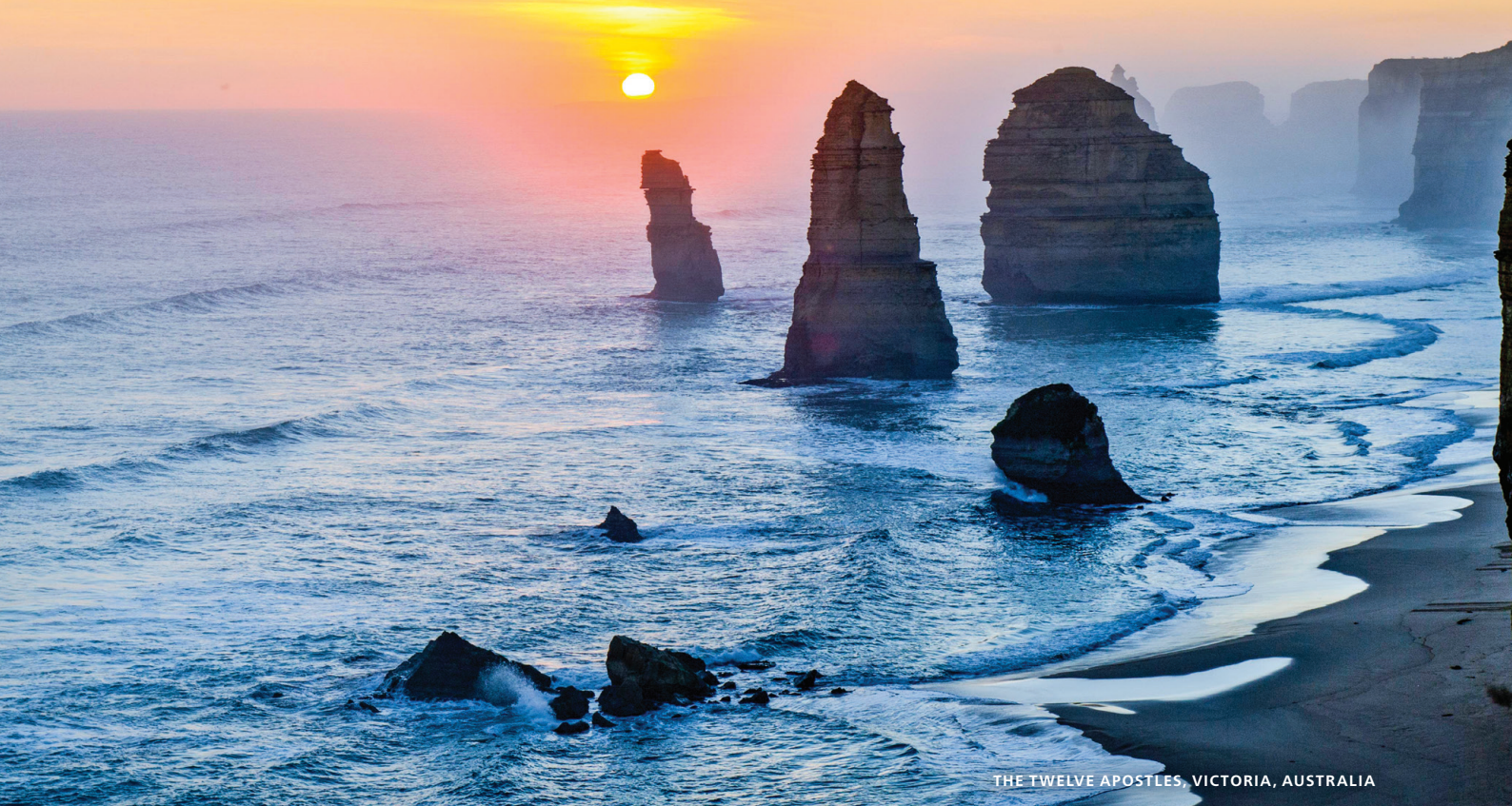
THE TWELVE APOSTLES, VICTORIA, AUSTRALIA

AUSTRALIAN AND NEW ZEALAND SPLENDOURS UP CLOSE. From the metropolitan cities of Melbourne and Sydney to the natural beauty of coastal New Zealand, guests will explore nine ports of call during this 15-day journey. Sip on famous regional wines, explore UNESCO World Heritage sites including the Blue Mountains, explore the historic treasures of Dunedin, and capture panoramic views from Mt. Victoria in New Zealand.