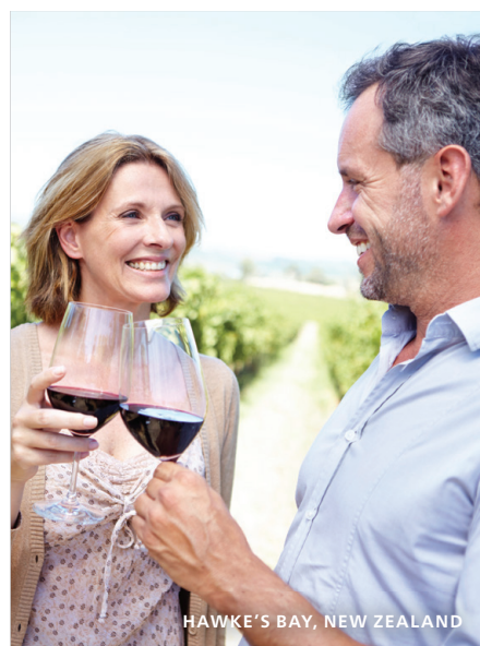
HAWKE'S BAY, NEW ZEALAND