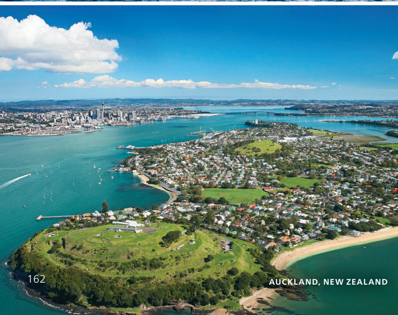
AUCKLAND, NEW ZEALAND