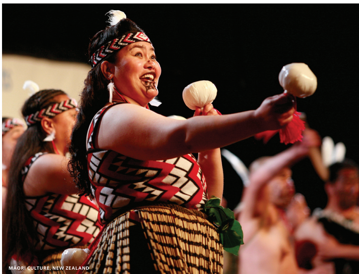
MĀORI CULTURE, NEW ZEALAND

FOR CURRENT OFFERS CONTACT US OR YOUR LOCAL VIKING AGENT