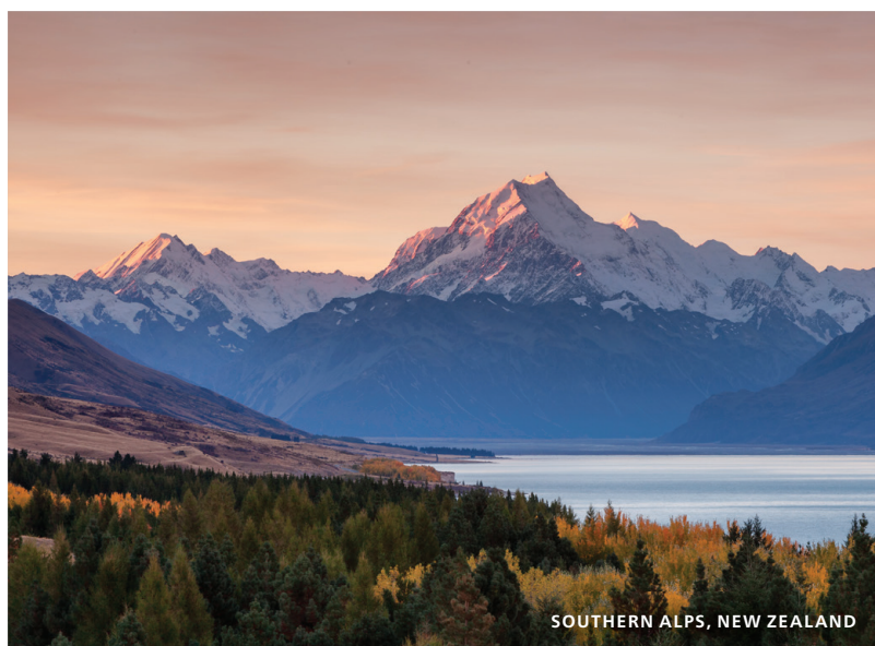
SOUTHERN ALPS, NEW ZEALAND